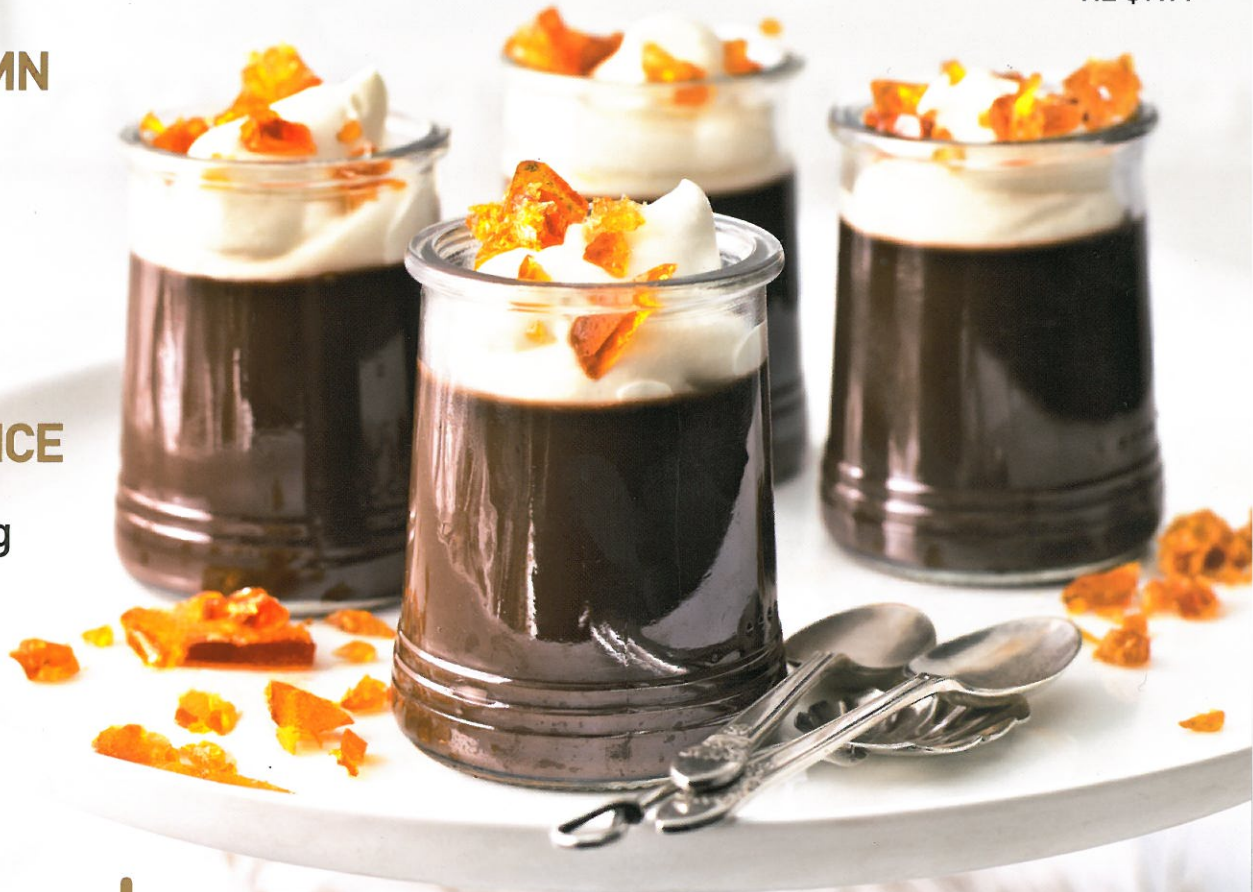
Valli Little's chocolate pots with salted caramel toffee